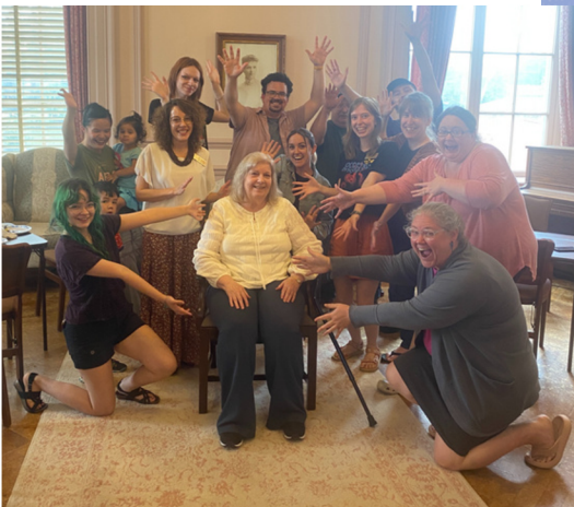
Staff celebrate at Ann's retirement party

4,480 library card holders 2,542 hours open 40,059 visitors That's 16 visitors per hour!