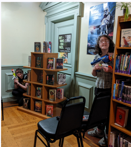
Teens enjoying NERF night at the library