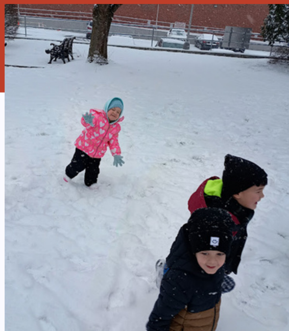
Playing in the snow after storytime!

It was a perfect day to play in the snow. The kids at storytime heard books about snow and even made a snow-themed craft, but the highlight of the day was when everyone bundled up and went out to throw snowballs, make snow angels, and even eat a little snow. One little girl stumbled while chasing another kid, but instead of getting upset, she just rolled over, giggled and made another snow angel.