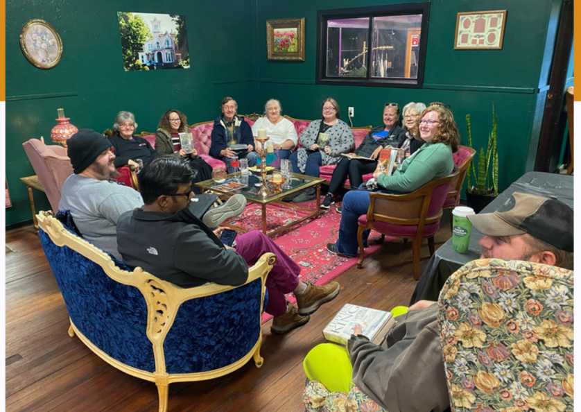
Books & Brews Club meeting at Book Cellars

the past with holding book clubs at places like The Wellsville Creative Arts Center. We even read Stephen King's Needful Things at our own Needful Things Antique Store ! This year we added brews to the mix. First up, we read a classic from Clive Cussler at the Wellsville Brewery then continued the cycle with meetings at coffee shops like Book Cellars and the Shop at Main. With a mix of fiction and non-fiction, the conversations were always robust and, in many cases, we left with a new understanding of that month's book. Beyond the Book Clubs, we offered a variety of fun events including watercolor classes, a poetry slam, yoga on the lawn and more! There were nearly 100 individual programs with over 1,000 participants.