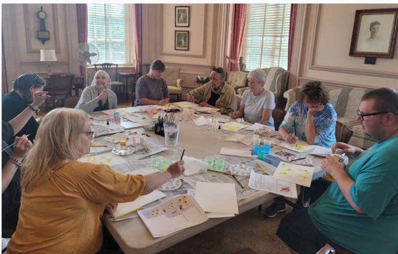
Learning the basics of watercolor