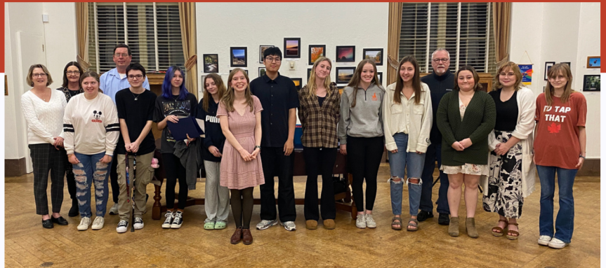
Winners of the 2024 Teen Photo Show

Throughout the year, we hold a variety of events for older and younger teens, including the Friday Club (Dungeons & Dragons, mafia, and other board games), NERF, hide-and-seek, puzzle adventures, crafts, and other games.