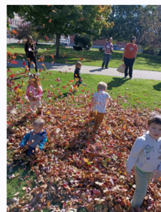
Enjoying a tromp through the fall leaves in the Library lawn.