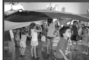
Parachute game in Children's section.