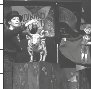
theatreFigures Puppet Theater at the Nancy Howe Auditorium, 2013