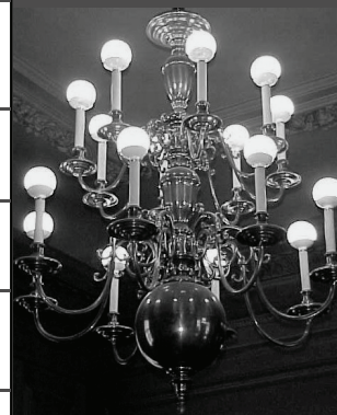
Updated lighting supplements traditional fixtures in Main Reading Room.