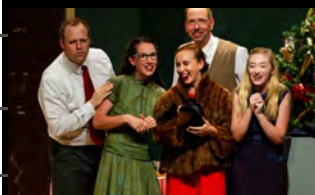
A scene from She Loves Me , the musical that was performed in the auditorium.