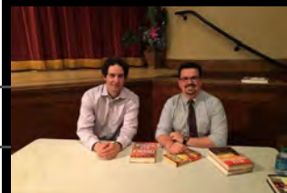
Author Alex Berenson signing books after his lecture.