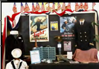
One display from the 3rd Annual History Awareness Week.

We had an eclectic set for all ages, including many new faces and some old favorites. One of the highlights was a visit from Alex Berenson, the best-selling author of the John Wells series. Mr. Berenson gave a lecture followed by an engaging Q&A.