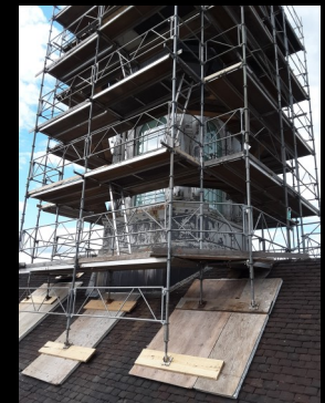
Special scaffolding was constructed to protect the roof and give full access to the cupola

The biggest challenge of 2019 was the renovation and maintenance of the cupola. After years of planning and preparations we were able to restore the cupola to it's former glory. In the process, nearly 70,000 honeybees were safely relocated from their home in the pillars!