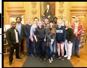
Architectural students from Alfred Stage College came for a full tour of the Building and Grounds