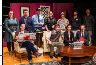
Frederick Knott's mystery Write Me a Murder was staged in the Nancy Howe Auditorium.

In 2019 we celebrated some major milestones, said some goodbyes and finished a massive building project.