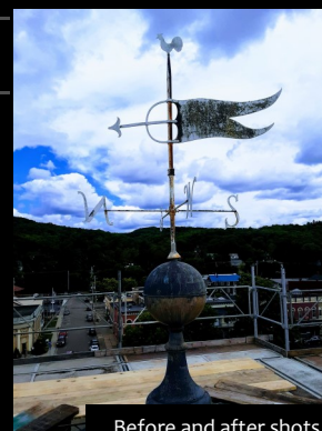
Before and after shots of the iconic weather vane.