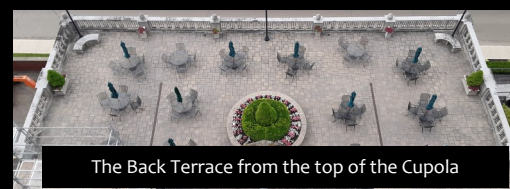
The Back Terrace from the top of the Cupola