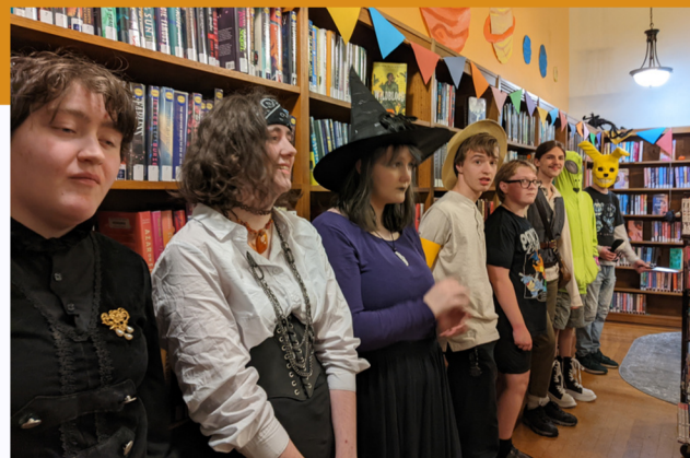
Costume contest judging at the annual Teen Halloween Party

Throughout the summer, as the teens tracked the minutes they spent reading on our leaderboard, many established personal rivalries, choosing someone else on the leaderboard and trying to read more than their rival. The competition must have been extra motivating, because this year our teens read 69,000 minutes—nearly double the number of minutes read the year before! It was a close race, but the blue team ultimately won, securing a popsicle party and commemorative winner buttons.