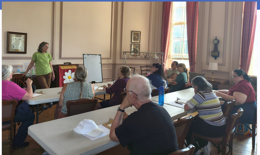
“The Joy of Drawing” class session

When it comes to adult programming, we always strive to take into account the interests and suggestions of our patrons. Having an adult drawing class had been in the works for a couple of years. So when the opportunity arrived to offer one, we jumped on it.