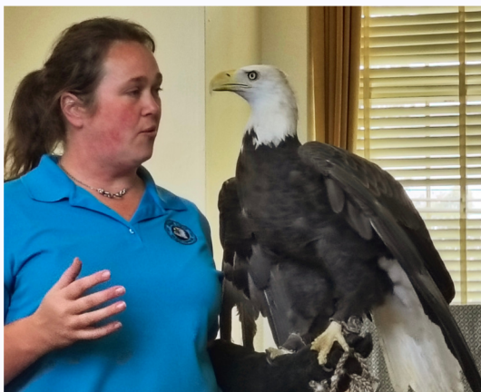
Hawk Creek Wildlife Center’s “Walk with the Eagles” in October

Throughout the year, we offered a number of different adult programs from mushroom cultivation, crochet classes, a cooking class, book clubs, an adult Dungeons & Dragons club, and more. We rounded out the year with two popular programs presented by Hawk Creek Wildlife Center, “Walk with the Eagles” and “Harry Potter Owls.” There was something for everyone!