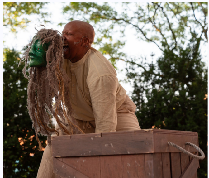
Shake on the Lake performs The Tempest

You might not expect to find a coffee truck and a traveling Shakespeare company in front of the library on a warm summer evening. But, that was the scene set in July. Shake on the Lake brought their production of The Tempest to the library lawn and, throughout the evening, the cast seamlessly (and hilariously) incorporated the SheBrews truck and staff into their kinetic, raucous performance. In that one evening, over 130 community members came out to visit the library and enjoy a professional theater experience, which was supported by patron contributions and funding from local organizations like Allegany