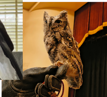
Hawk Creek Wildlife Center’s “Harry Potter Owls” in December